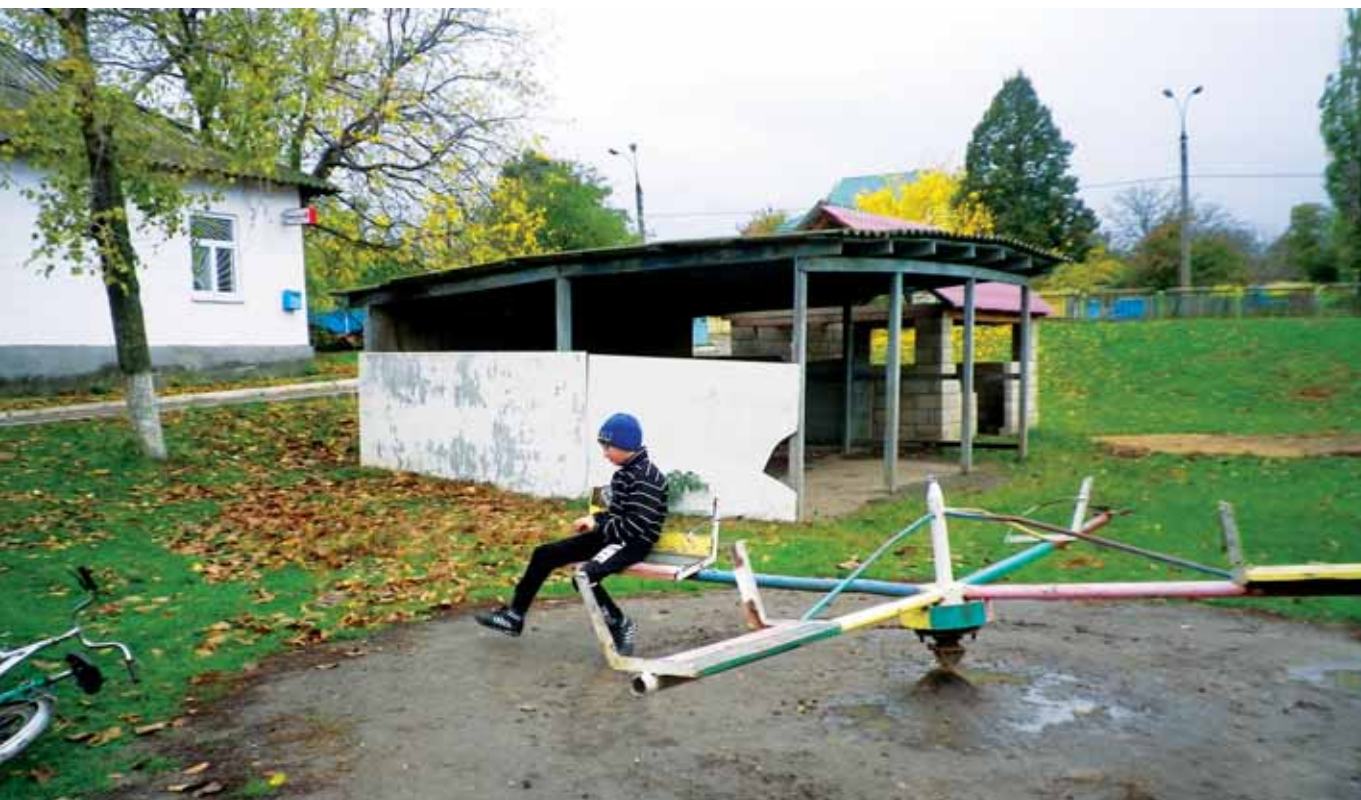
↑ LEFT BEHIND BY THEIR PARENTS: MAINLY CHILDREN AND OLD PEOPLE POPULATE THE PROVINCIAL TOWN OF RADOAIA