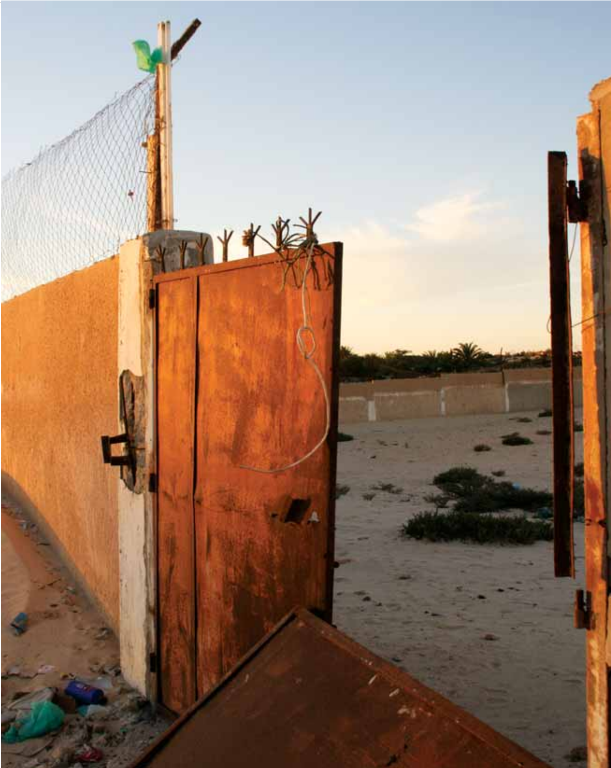
↑ THE DETENTION CAMP GUANTANAMITO IN NOUADHIBOU, A NOW ABANDONED PLACE OF DEPORTATION

vertheless, some migrants have become successful business people – as long as they are prepared to take on Mauritanian business partners and make adequate tribute payments. Well-to-do and long-