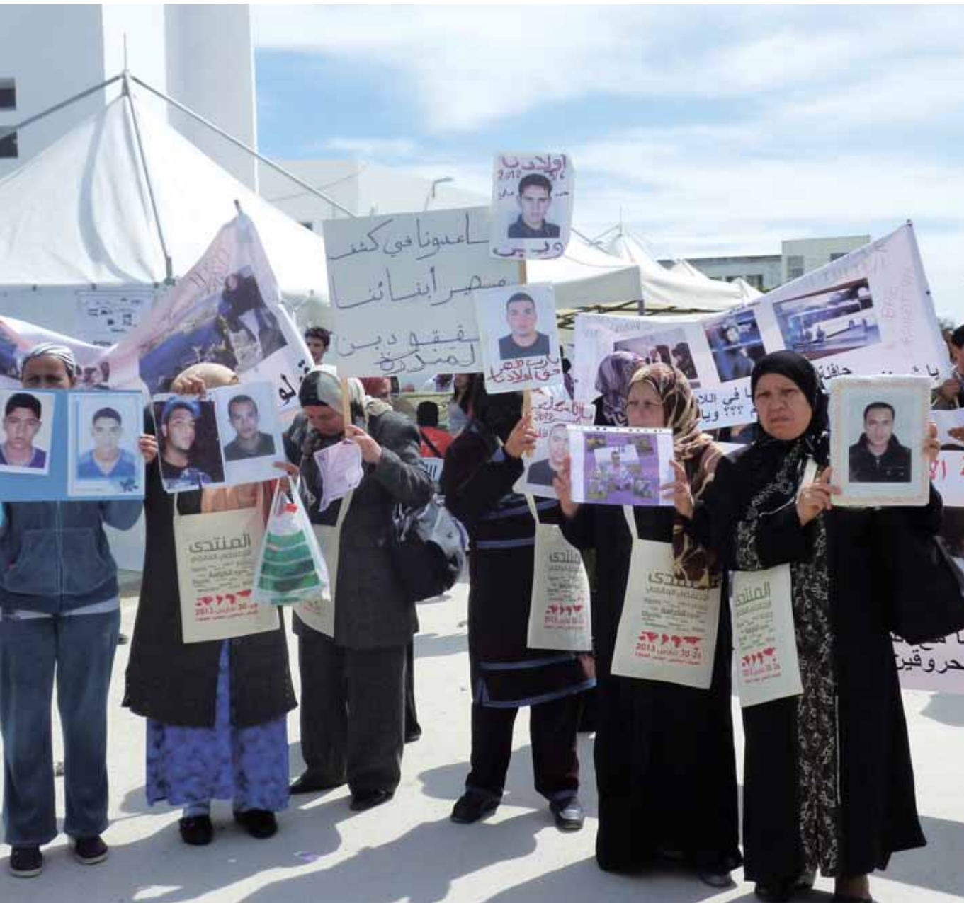
↑ A PROTEST BY MOTHERS AND RELATIVES OF MISSING BOAT PEOPLE DURING THE WORLD SOCIAL FORUM IN TUNIS

employees can selectively be brought into the European labour market as required. This, however, is conditional on a European member state issuing an appropriate permit.