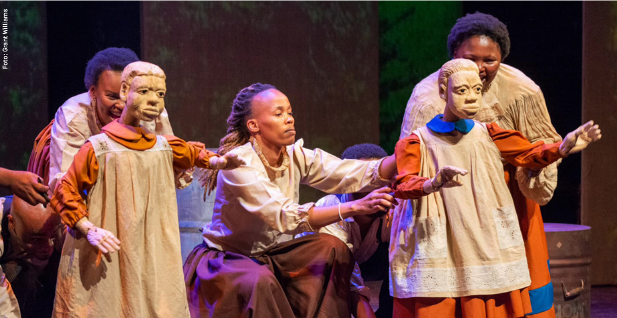
Through experimental puppet theater, the Ukwanda Puppet Collective communicates social and political issues and introduces marginalized youth to artistic expression.