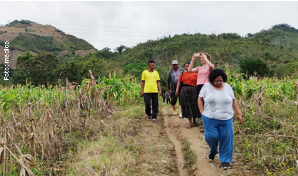
Indigenous communities in Guatemala: For the right to land.