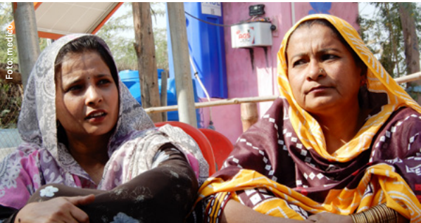
Pakistan: What to do after the flood?