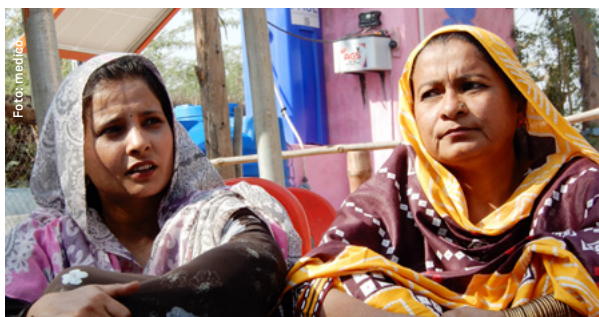
Pakistan: What to do after the flood?