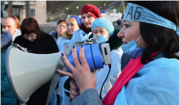
Even in war, the struggle for health reform continues.