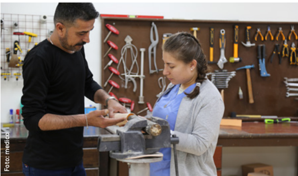
Helping people to live on: the prosthetic workshop in Qamişlo