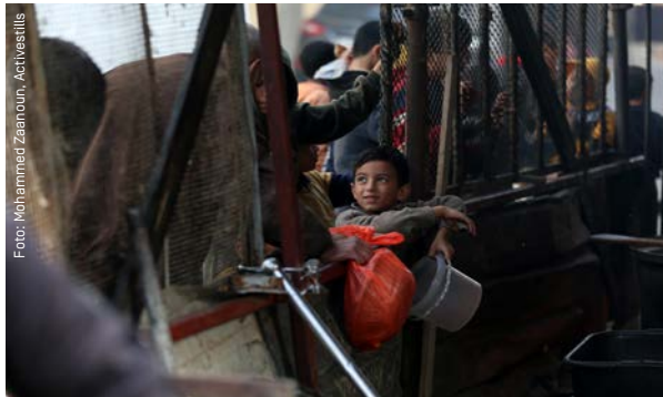
The war in Gaza continues. medico partner organisations are providing emergency aid under the most difficult conditions.

€ 3,577,730.14 (incl. support from AA and BMZ)