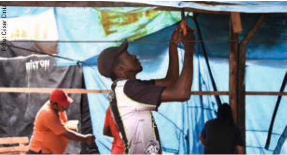
The MTST homeless workers' movement is fighting for the right to housing in Brazil.