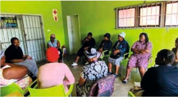
The Phephisa Survivors Network empowers survivors of sexualised and gender-based violence in South Africa.