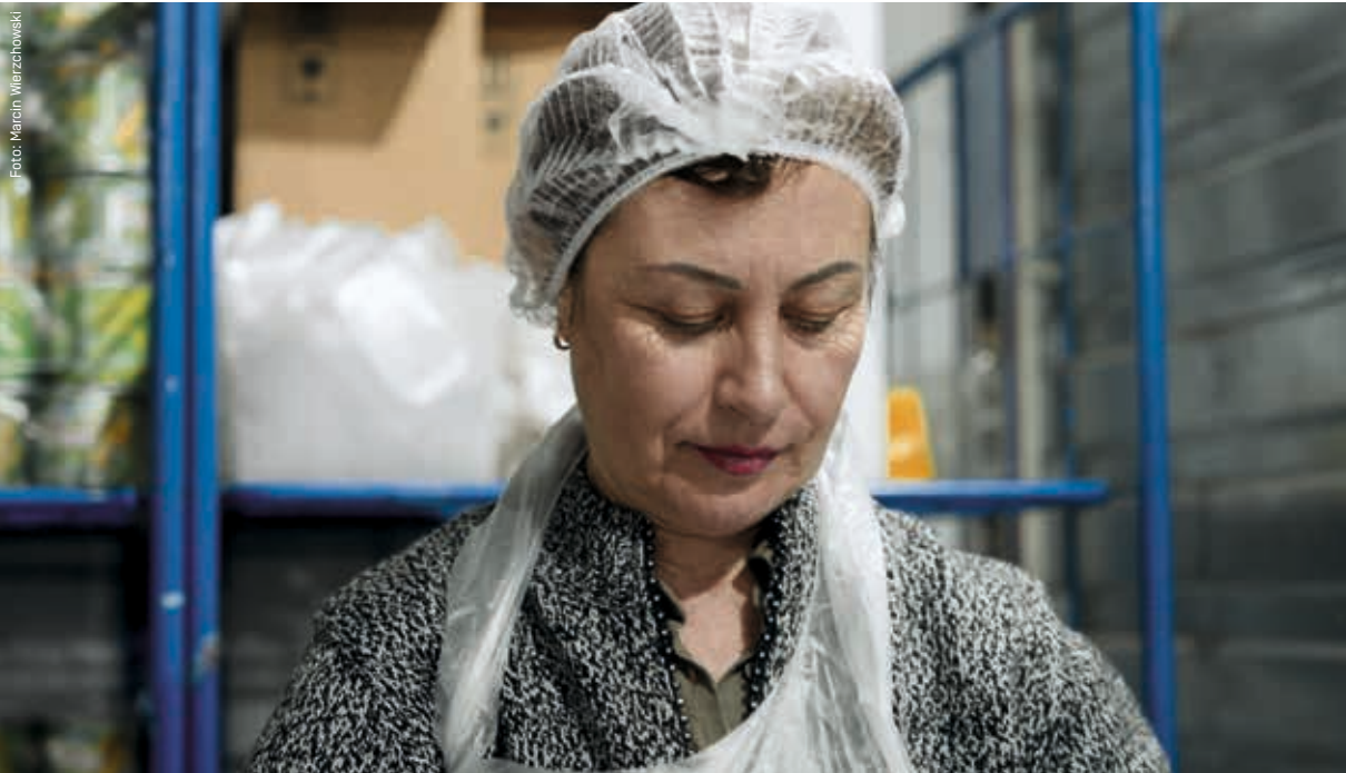
In a canteen kitchen run by our partner organisation Mirnoe Nebo (Peaceful Heaven), food is prepared for distribution to internally displaced persons and other people in need in the eastern Ukrainian city of Kharkiv.