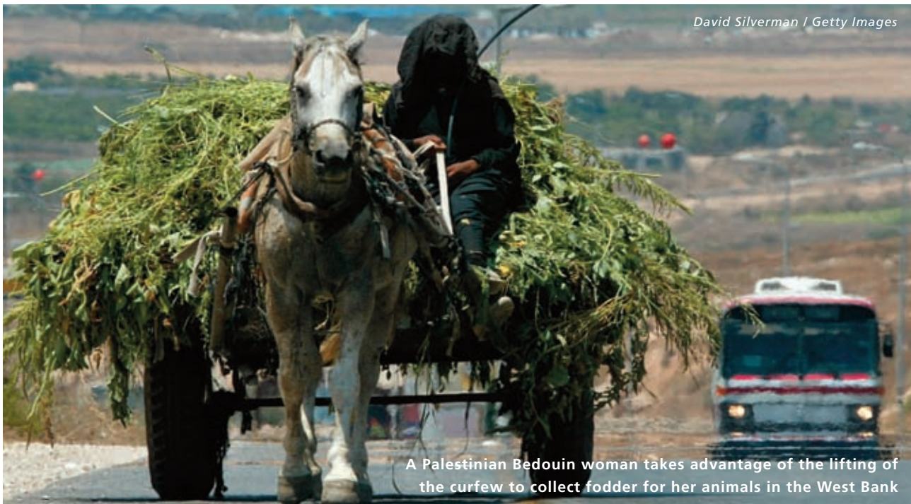
A Palestinian Bedouin woman takes advantage of the lifting of the curfew to collect fodder for her animals in the West Bank

Individual projects cannot adequately address the deteriorating economic situation of Palestinians, nor create the conditions needed to build confidence in a political solution. Given the existence of technical frameworks to monitor progress on commitments already made, such as the roadmap and the Agreement on Movement and Access, the Quartet could use more of its resources to ensure that the political will to change things on the ground is created and concrete follow-up is undertaken. The Quartet should provide regular, public information on progress it has made to date on projects to help build confidence in private sector initiatives. The Quartet Representative should commission and publicise legal analysis of any proposed project to ensure that such interventions do not violate international law.