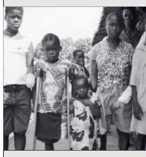
A group of amputees poses for the camera, Freetown 1999.