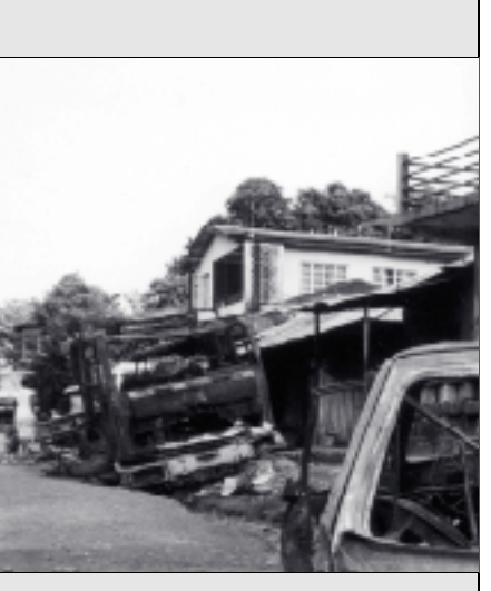
Destruction in Freetown, January 1999.

In recent years there have been a number of Belgian judicial inquiries which have shown that the system violates almost any definition of neutrality, and is an invitation to corruption.