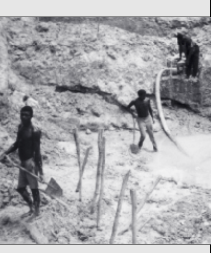
A small pump drains an alluvial diamond pit.