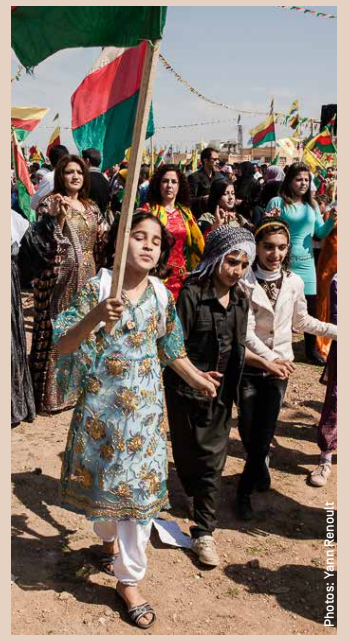
Kurds celebrate spring festival Newroz on the 21<sup>st</sup> of March in Qamishli/Rojava (Syria).

The Kurdish region Rojava in Syria needs help!