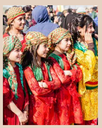
Newroz 2014 in Qamishli/Rojava.