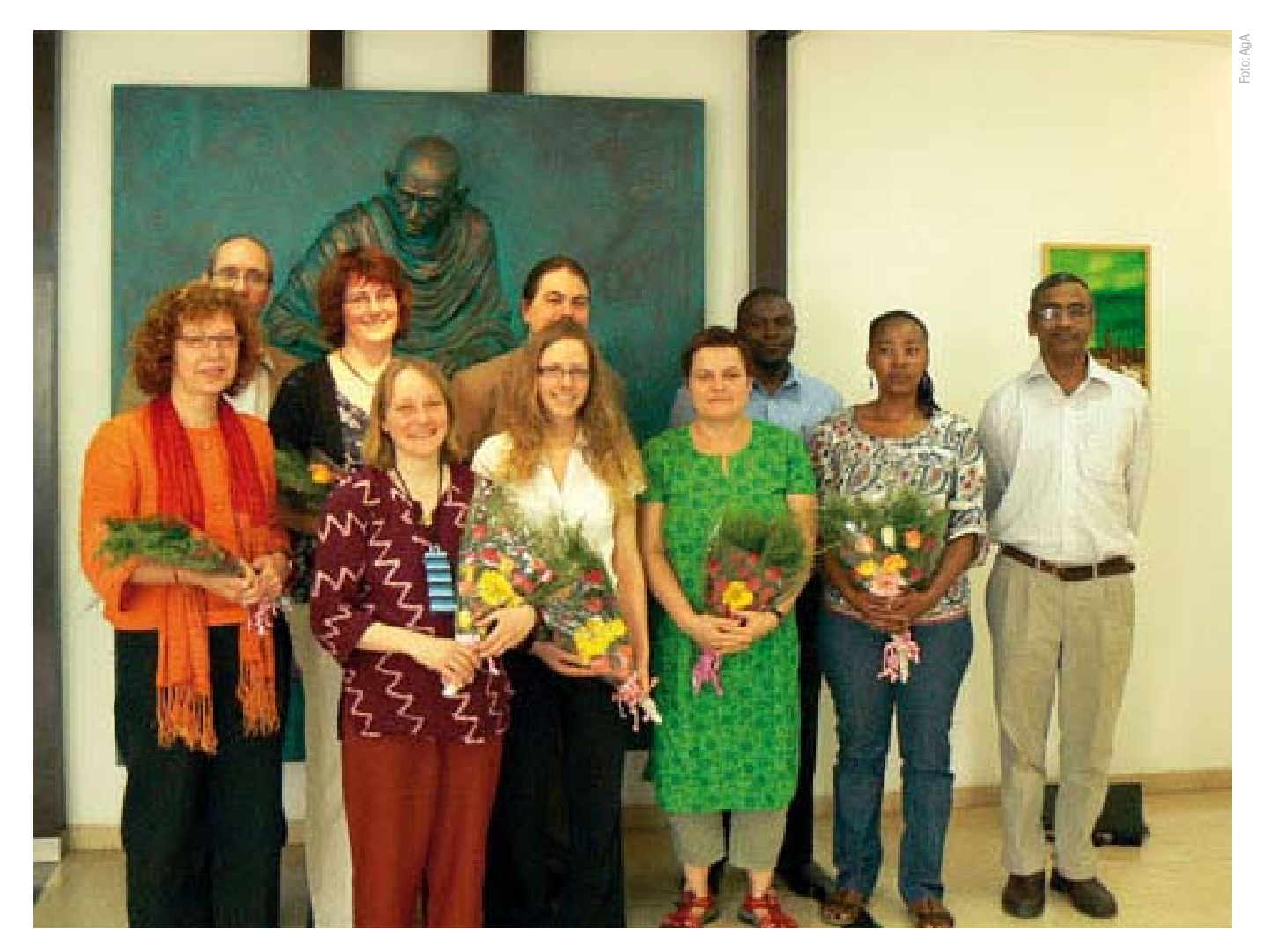
Internationale Delegation des Aktionsbündnisses gegen AIDS und seiner Partner unter den Augen Mahatma Gandhis.

Auf die meisten neueren Aidsmedikamente haben die Originalhersteller Patentanträge in Indien gestellt. Laut indischen NROs kommt es jedoch einer Schatzsuche gleich, herausfinden zu wollen, für welche Substanz ein Patentantrag in Indien gestellt wurde. Biochemiker werden benötigt, um das jeweilige Präparat aufgrund der chemischen Substanz identifizieren zu können. Außerdem gibt es bisher noch kein zentralisiertes Antragsverfahren. Wer in Indien rechtzeitig Widerspruch gegen Patentanträge einlegen möchte, muss aufwendig recherchieren - die indische NRO Lawyers Collective hat dies in 15 Fällen getan. Laut indischem Patentgesetz (Section 3d) erhält eine leichte chemische Veränderung