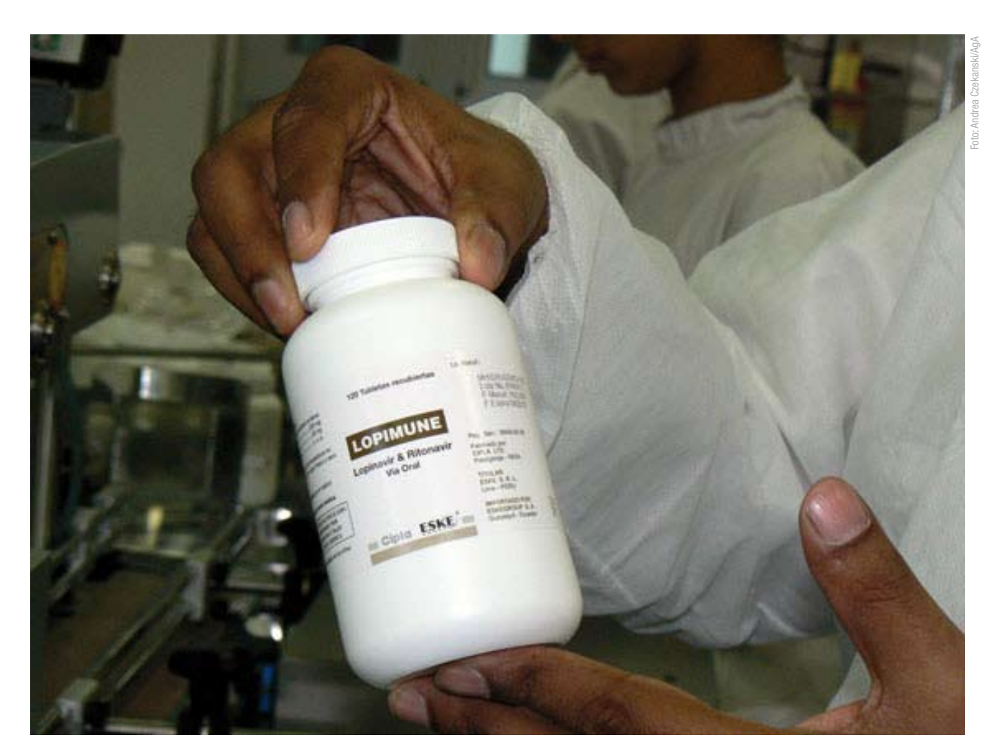
Lopinavir/Ritonavir is marketed as Lopimune® by Cipla.