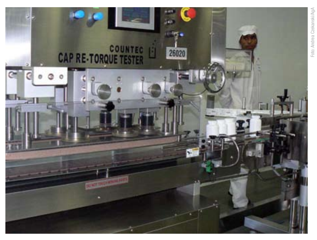
Aids drug production of the Indian generics firm Cipla.

8 see James Love, Knowledge Ecology International, http://www.keionline.org/misc-docs/ftcgilead12feb07.pdf