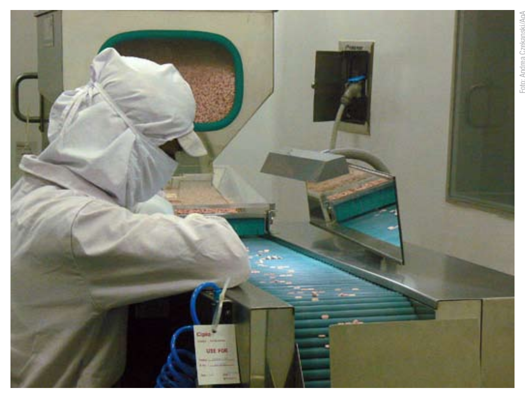
Quality check of the Indian generics firm Cipla.