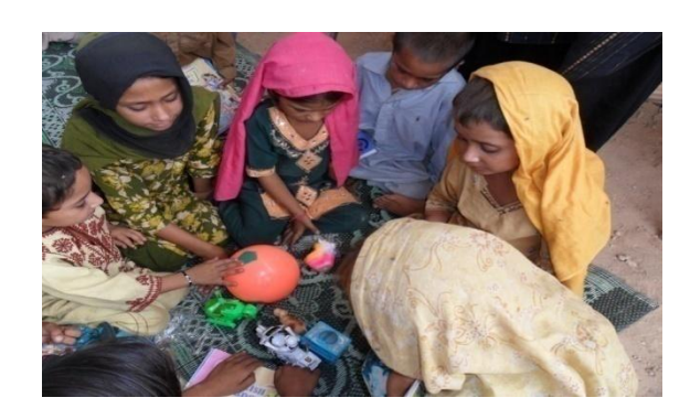
Achievements of HELP